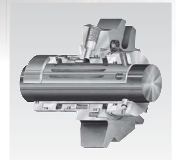
The Model 595 Dual Pumping Cartridge Seal

Hastelloy is a trademark of Hayes Int'l, Inc., Aflas is a trademark of Asashi Glass Co., Ltd.