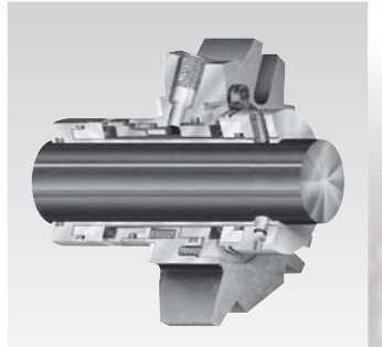
The Model 590 Dual Stationary Cartridge Seal

ASI has designed a selection of mechanical seals for virtually all industrial applications