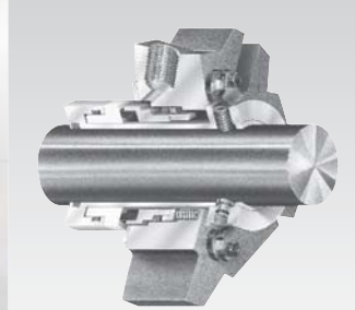
The Model 585 Single Stationary Cartridge Seal